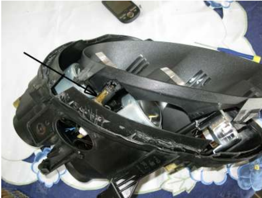
13. Once the lighting block is completely removed (photo 12),