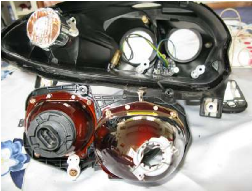
14. Remove these 3 screws from the dipped beam assembly (photo 13).